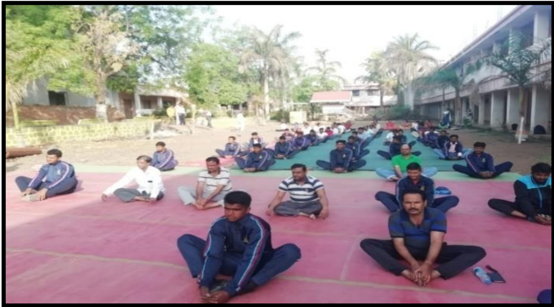
Participants performing “Bhadrasana”